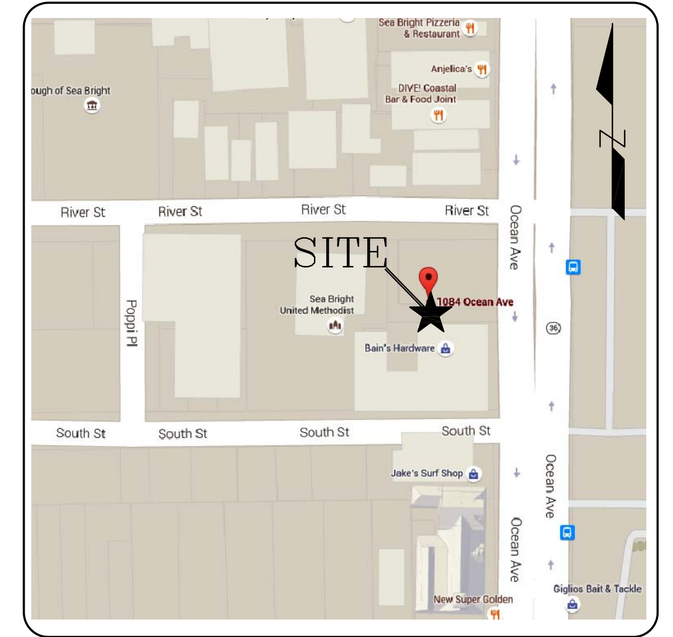
KEY MAP SCALE: 1" = 85' ±