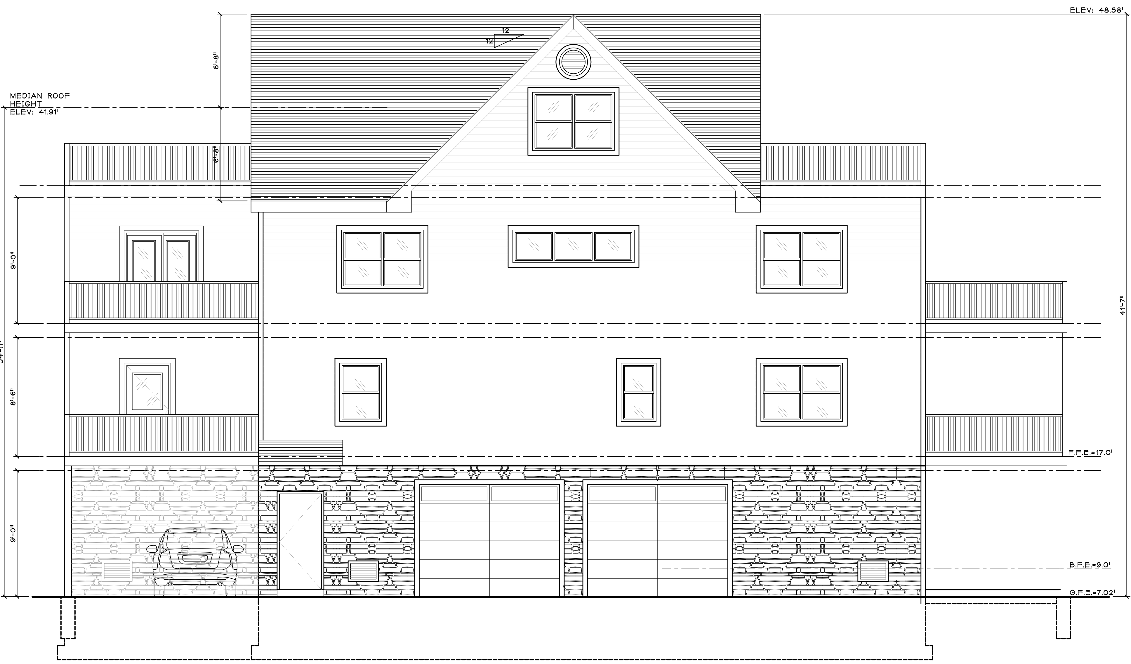
2 SIDE ELEVATION SCALE: 1/4" = 1'-0"