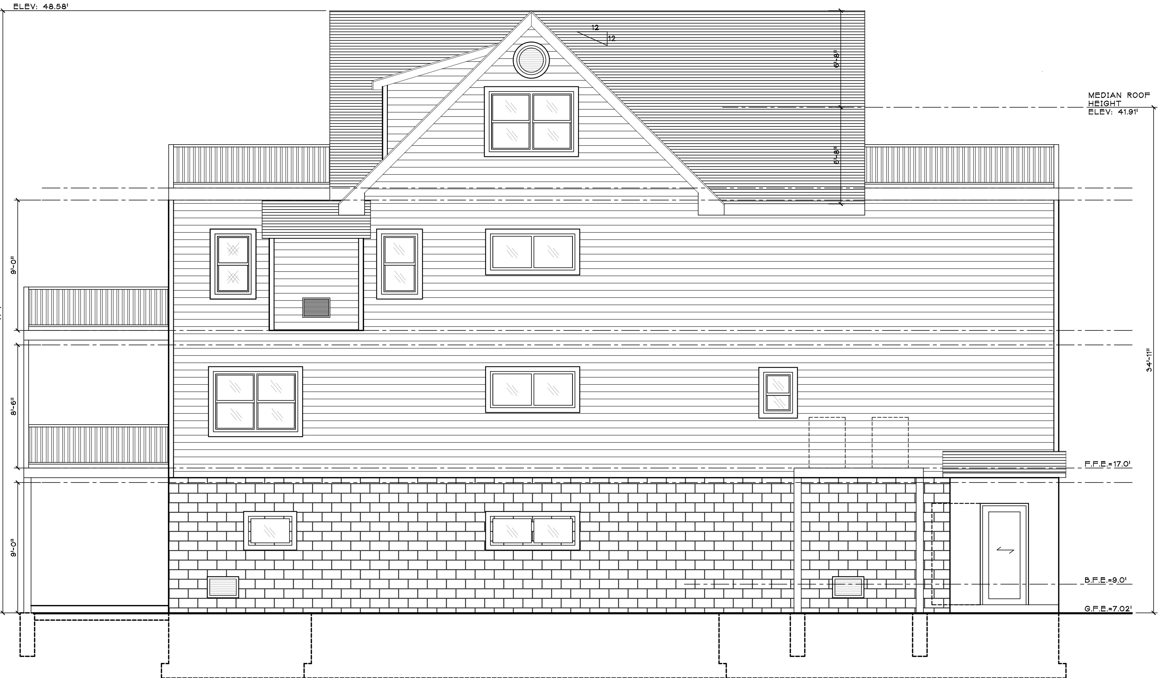
4 SIDE ELEVATION SCALE: 1/4" = 1'-0"