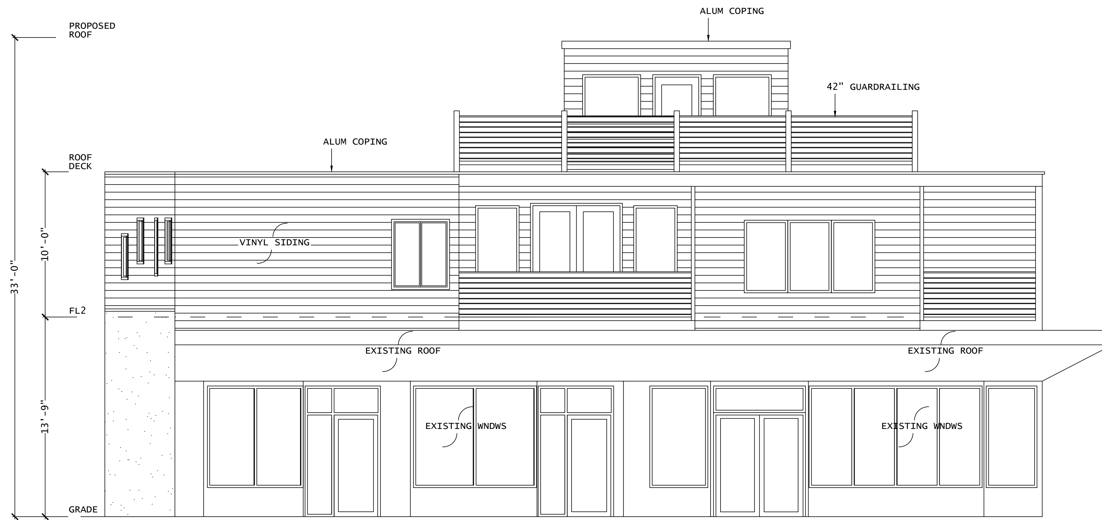
PROPOSED OCEAN AVENUE ELEVATION 1/4"=1'-0"