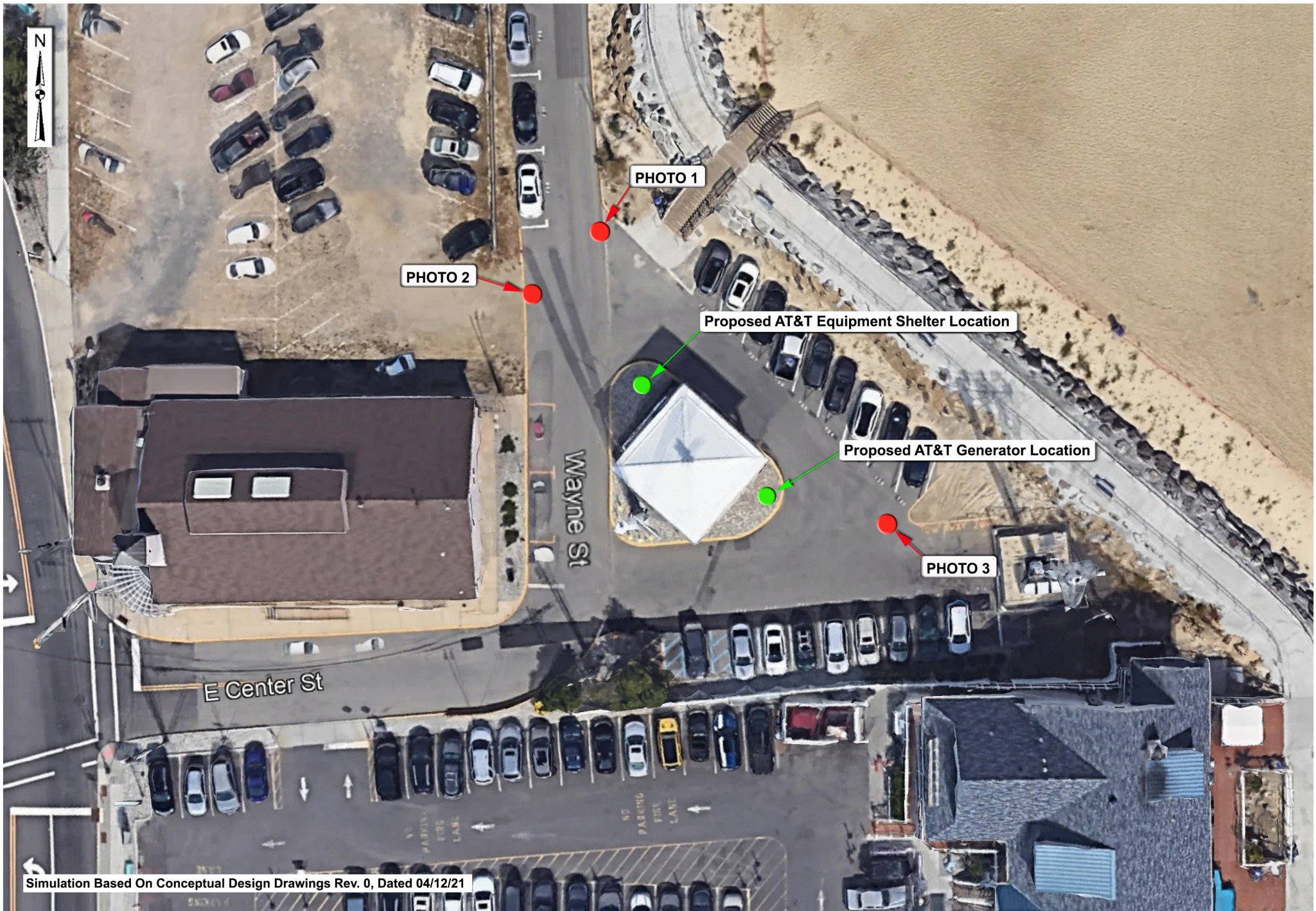
Simulation Based On Conceptual Design Drawings Rev. 0, Dated 04/12/21