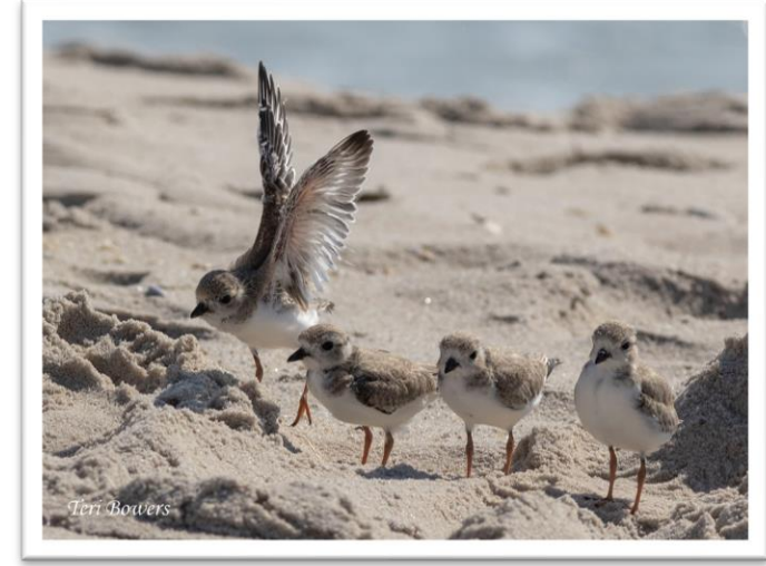
Seaside Park fledglings